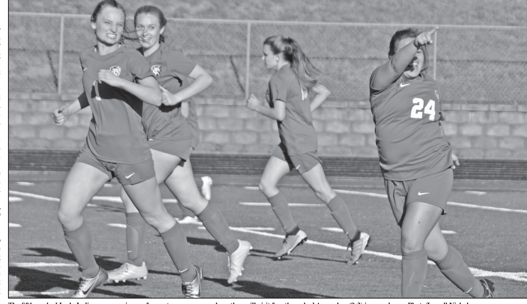
The fifth-ranked Lady Indians are gearing up for postseason soccer where they will visit fourth-ranked Armuchee (9-3) in round one.

The Lady Indians took on the first match, only losing by one point with a score of 4-3 to the No. 1-ranked Redskins.